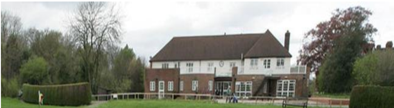
Wrotham Heath Golf Club – Club House & Pro Shop

The final entries for the above competition are now in and the total number of finalists is 116, up from 102 last year. The number of original entrants is also higher at 3,320 compared to 3,029. We look forward to welcoming our 65 ladies and 51 men's finalists on the day. On behalf of the Charity and all members of the Golf Management Committee, thank you to every golf club for their participation and to each and every competitor for your continued support and generosity. We are still seeking sponsors for the 18 holes contested on the day at £60 per hole, giving sponsors the opportunity to advertise on each tee, in the match programme and possibly the local press. Please contact the Secretary for all details.